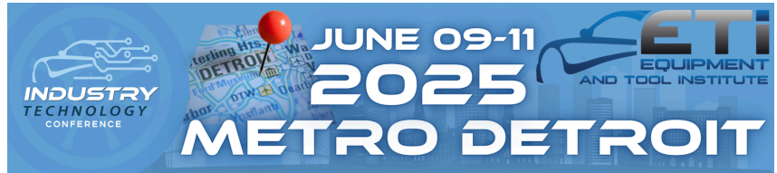
Thank you to all who joined us for our first Industry Technology Conference. It started with a golf outing and finished with a tour of the Ford Piquette Plant Museum. There were 115 attendees, representatives from 9 OEM's and updates from another 2. This event was a great success thanks to all our interesting presenters, sponsors, OEM's and attendees. We look forward to seeing you at our next event.